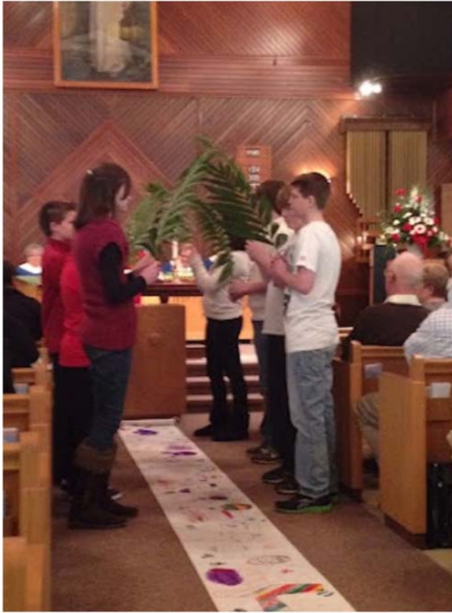
The senior youth formed the palm canopy.