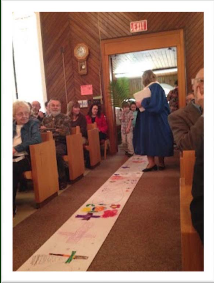
Starting the palm parade.