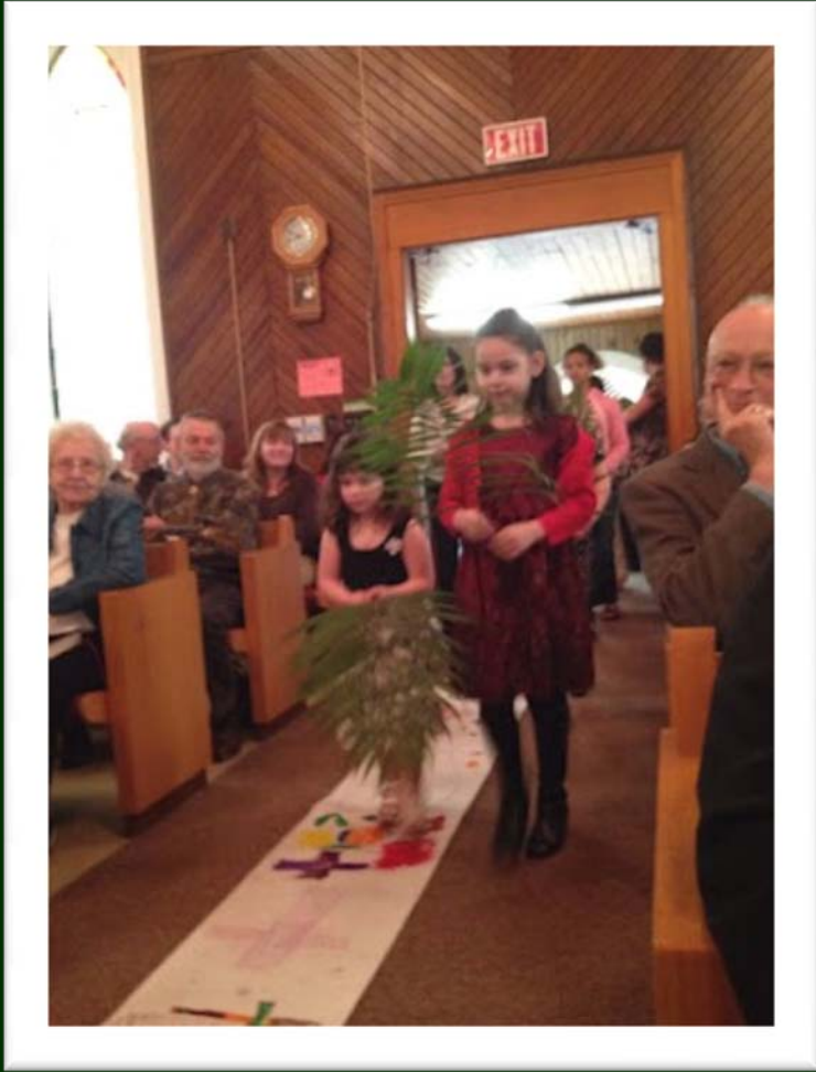
Even the little ones participated.